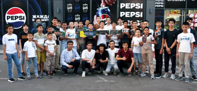
O'quv markazda o'tkazilgan oylik musobaqalar