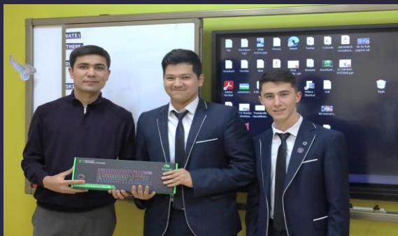
Yoshdasturchi.uz musobaqasi prezident maktabida